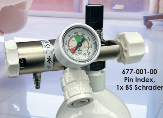
677-001-00 Pin Index, 1x BS Schrader

Units are available with both a pressure outlet and a flow outlet and these can be used for either purpose of both simultaneously.