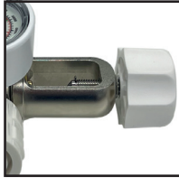
Pin Index Yoke Articulating