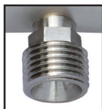
3/16" THREADED THERAPY CONNECTOR