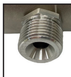
3/8" BSP THREADED THERAPY CONNECTOR