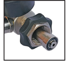
DIN 477 (G 3/4")