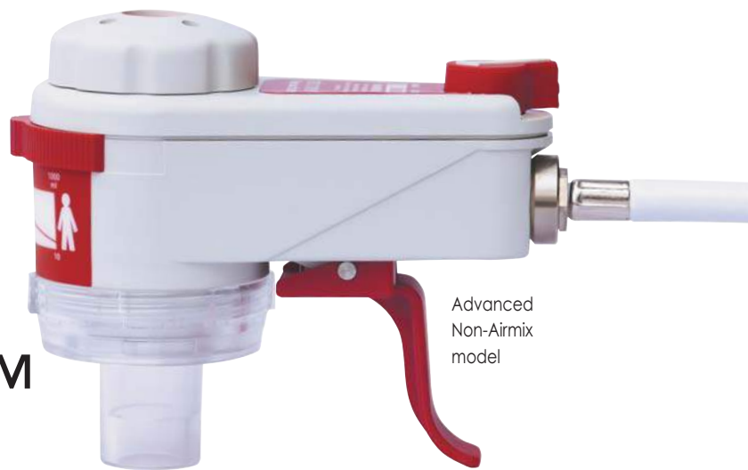
Advanced Non-Airmix model