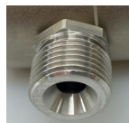
3/8" BSP THREADED THERAPY CONNECTOR