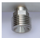
9/16" THREADED THERAPY CONNECTOR