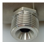
3/8" BSP THREADED THERAPY CONNECTOR