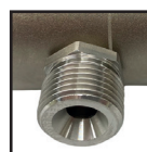
3/8" BSP THREADED THERAPY CONNECTOR