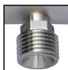
9/16" THREADED THERAPY CONNECTOR