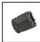
3/8" BSP Nut + Liner