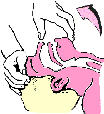
Figure 2: Opening the airway