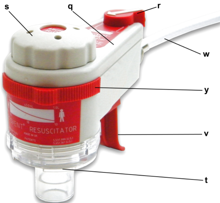
Figure 1: The microVENT resuscitator (Adult / Child model illustrated)