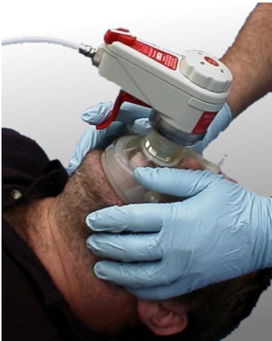
Figure 3: Operating the microVENT resuscitator using the manual trigger.

The microVENT and face mask can be held in position by both hands while maintaining the patient's airway and operating the manual trigger.