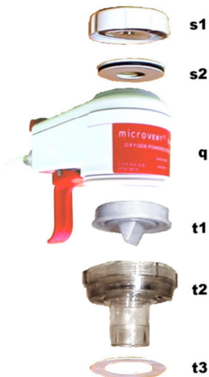
Figure 6: Component assembly

The microVENT Handset Component Assembly.