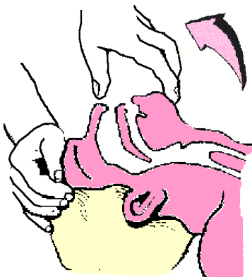
Figure 3: Opening the airway