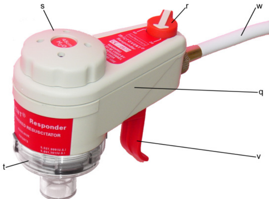
Key to components in figure 1: The microVENT Responder Resuscitator