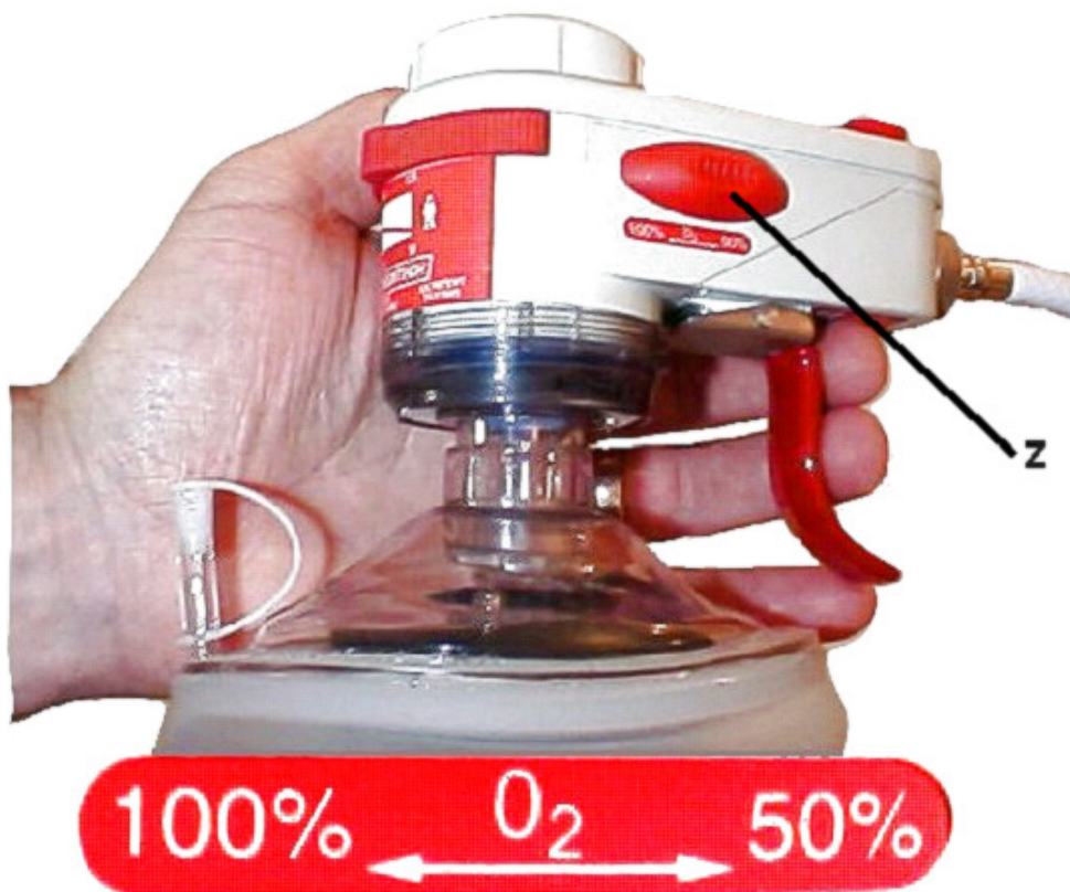
Figure 5: Airmix